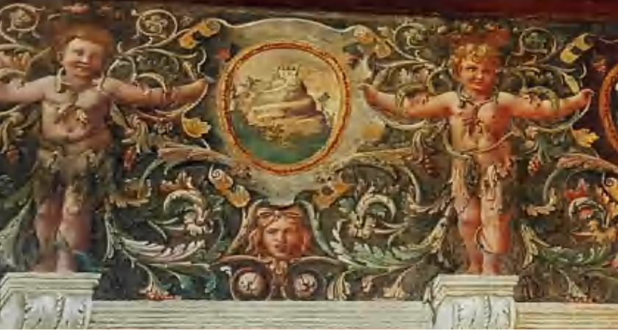
Fresco by Giulio Romano Palazzo Te, Mantua, 1524-1534 A.D.